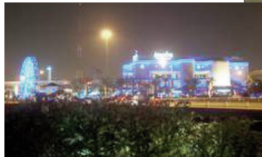
Photos clockwise from top left: Minute Maid Park, The Galleria, Downtown Aquarium.

Detailed Workshop Information will be available on-line at www.annualmeeting.ponyclub.org